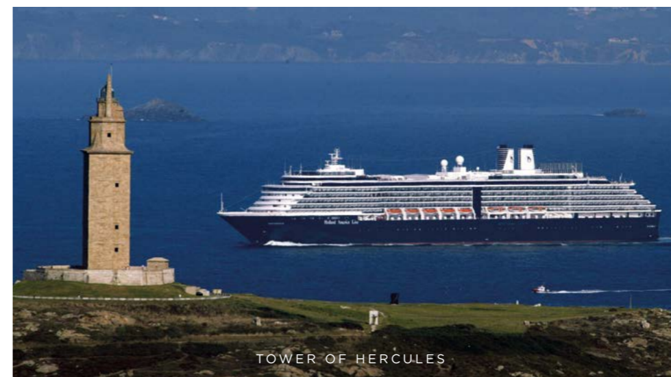
TOWER OF HERCULES

You will get a taste of the city's life with a wealth of detail.