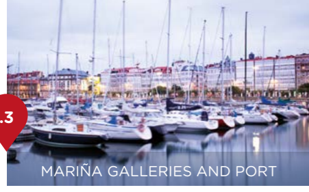
MARIÑA GALLERIES AND PORT