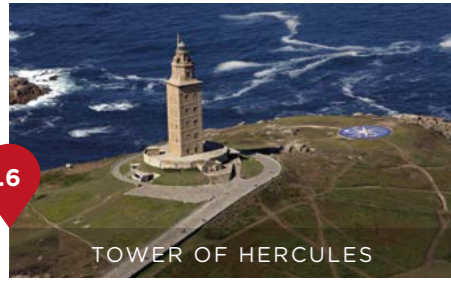
TOWER OF HERCULES