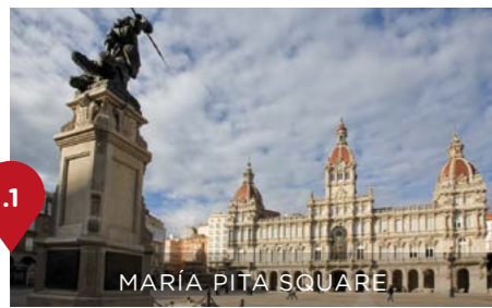
MARIA PITA SQUARE