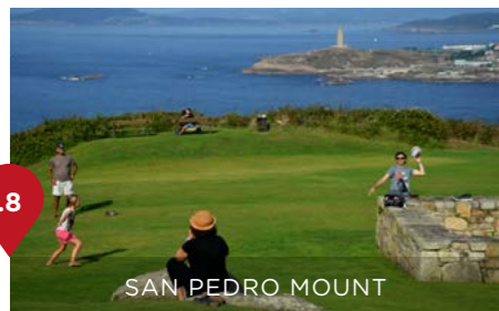
SAN PEDRO MOUNT