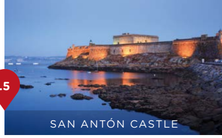
SAN ANTÓN CASTLE