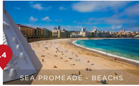
SEA PROMENADE - BEACHES